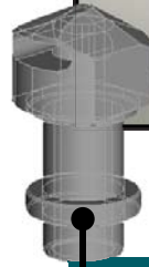
3-D CAD drawing of a replacement air / water nozzle for a flexible endoscope.